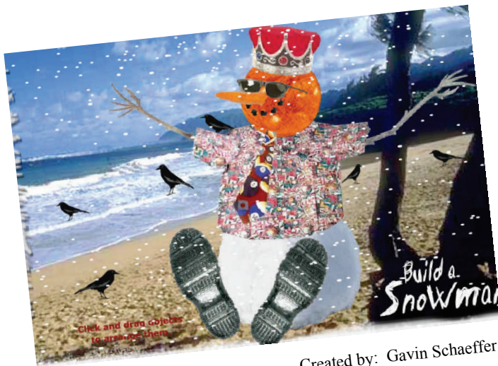
Created by: Gavin Schaeffer